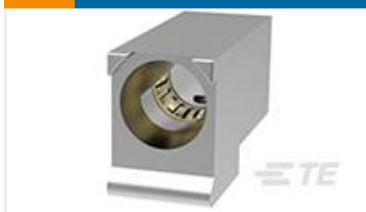
TE Part # 2000713-3 RA Keyed Guide Mod, Vita 46, Machined