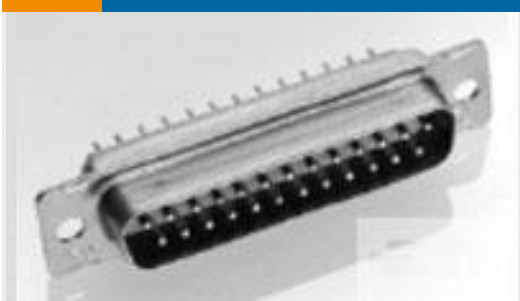
TE Part # 1757820-4 AMPLIMITE,ASY,RCPT,STD,109,ZN,4