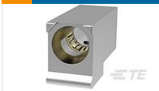
TE Part # 2000713-2 RA Keyed Guide Mod. Vita 46, Machined