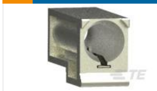
TE Part # 1-1469492-9 MULTIGIG RT 9MM GUIDE/ESD UNKE