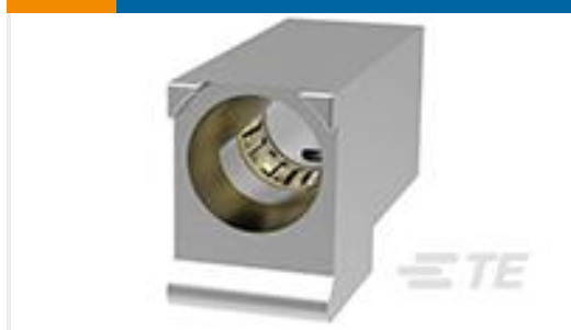
TE Part # 2000713-1 RA Keyed Guide Mod, Vita 46, Machined