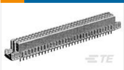
TE Part # 535090-4 096 EURO TYPE C RECEPT ST ASSY