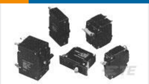
TE Part # 6-1393252-1 W67-X2Q12-30=M6/M7/M9/W6/W7