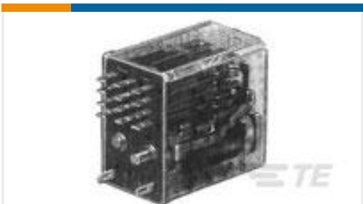
TE Part # 1-1393766-9 R10-E1X4-24V=R10