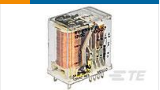
TE Part # 1-1393767-5 R10-E2X2-V700=R10