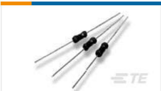
TE Part # 7-1625890-0 2W SM M/OX 5% 82K