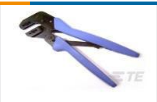
TE Part # 58525-1 PROCRIMPER TOOL & DIE