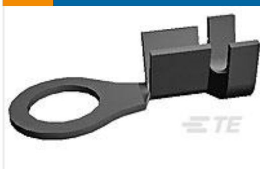
TE Part # 626037-2 RING TONGUE TERMINAL 4.0-6.0 MM2 TPBR