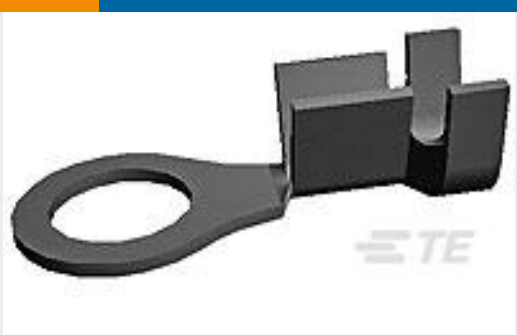
TE Part # 61844-1 RING TERMINAL 12-10 AWG .0395X. 650 TPCU