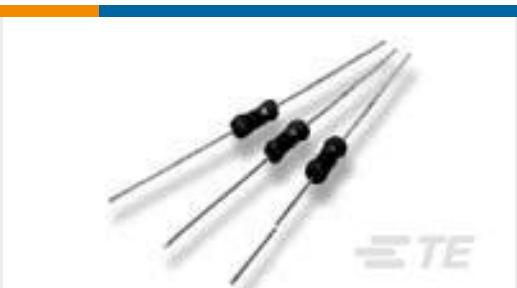
TE Part # 7-1625890-0 2W SM M/OX 5% 82K