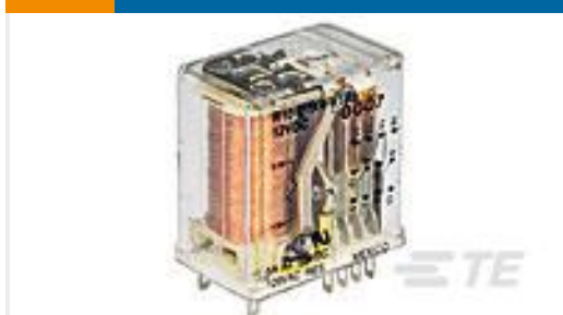
TE Part # 1-1393767-5 R10-E2X2-V700=R10