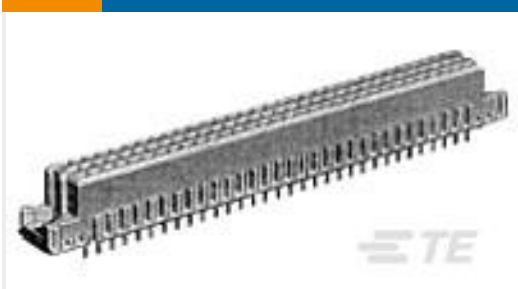
TE Part # 535090-4 096 EURO TYPE C RECEPT ST ASSY