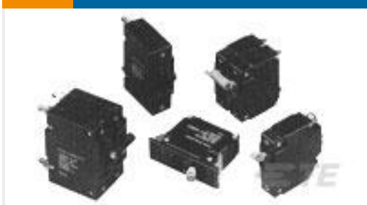
TE Part # 6-1393252-1 W67-X2Q12-30=M6/M7/M9/W6/W7