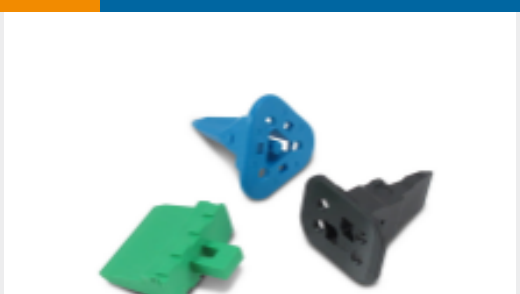
TE Part # W2S Wedgelocks: DEUTSCH DT