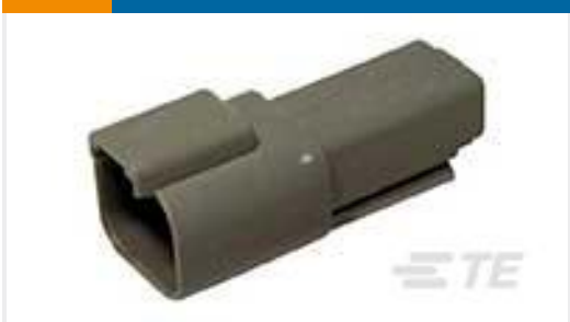
TE Part # DT04-2P REC, 2P, GRY, N