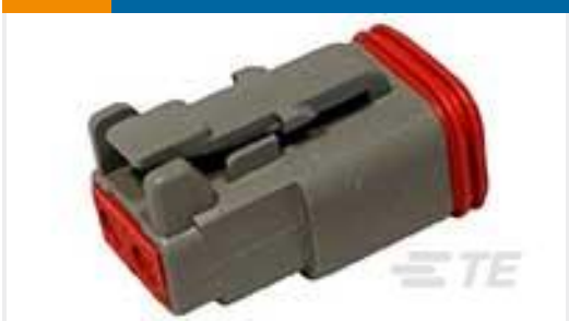
TE Part # DT06-2S PLG, 2P, GRY, N