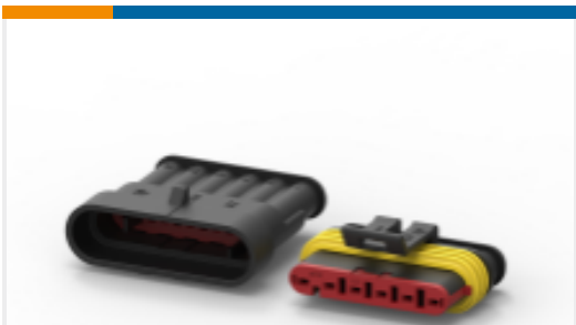
TE Part # 282104-1 AMP SUPERSEAL 1.5MM, CONNECTOR HOUSING