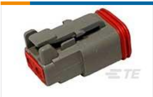
TE Part # DT06-2S PLG, 2P, GRY, N