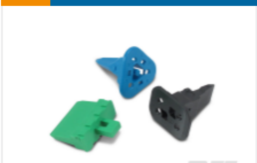
TE Part # W2S Wedgelocks: DEUTSCH DT