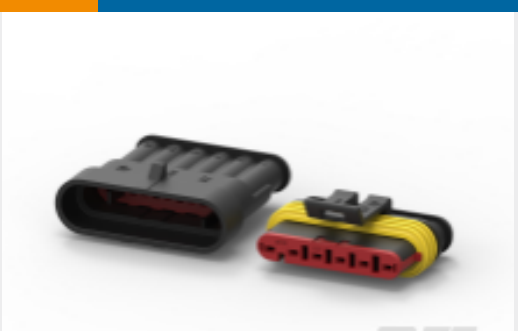
TE Part # 282104-1 AMP SUPERSEAL 1.5MM, CONNECTOR HOUSING