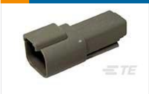
TE Part # DT04-2P REC, 2P, GRY, N