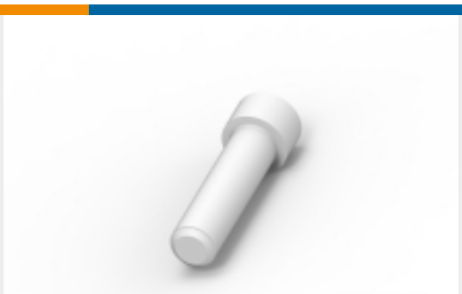
TE Part # 114017-ZZ SEALING PLUG, SIZE 12/16, WHT