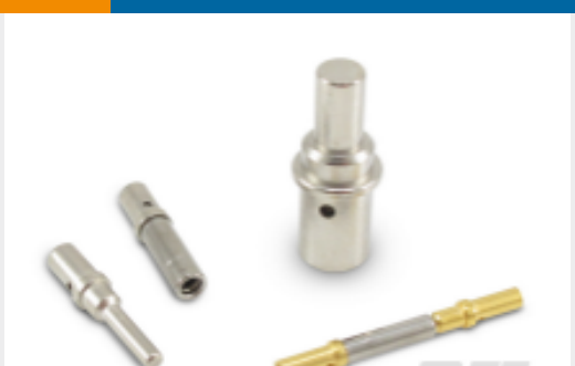
TE Part # 0460-202-16141 DEUTSCH Solid Contacts