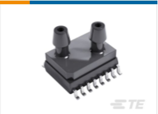
TE Part #9541-040C-D-C-3-S PRESSURE I2C 0.6 PSID SO16

ENG_CVM_CVM_9333-BCE-S-125-000_1.2d_dxf.zip