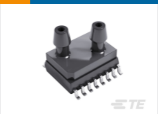
TE Part #9541-010C-D-C-3-S PRESSURE 0.15 PSID I2C SO16