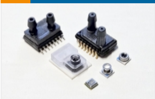
Board Mount Pressure Sensors(24)