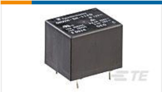
TE Part # 1-1721150-3 ORWH-SH-112D1F,000