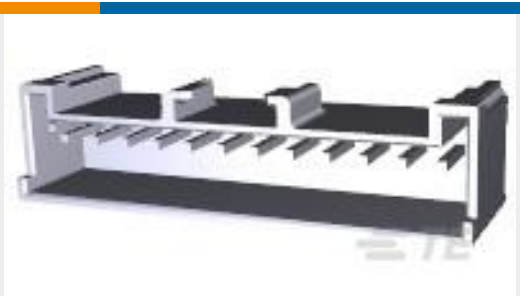
TE Part # 917790-2 2.5 SDL POST HDR ASSY 12P RED