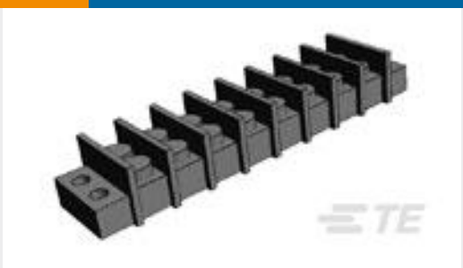
TE Part # 1546306-8 8P .374" DR BARRIER STRIP