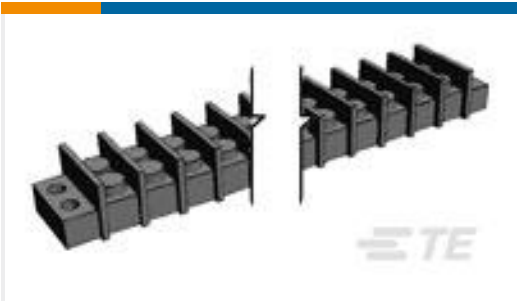
TE Part # 1-1546306-2 12P.374" DR BARRIER STRIP