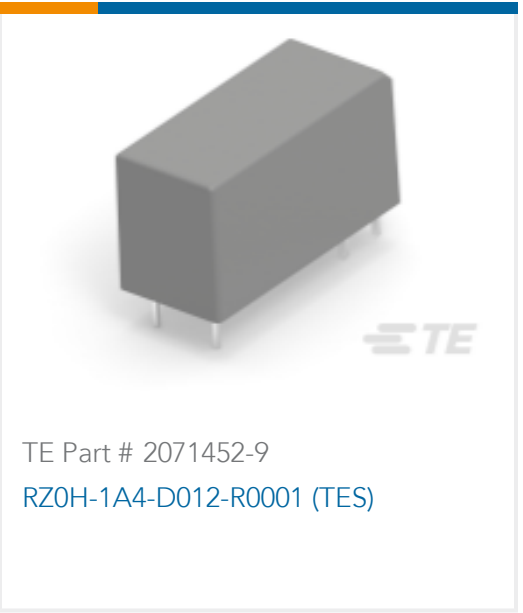
TE Part # 2071452-9 RZ0H-1A4-D012-R0001 (TES)