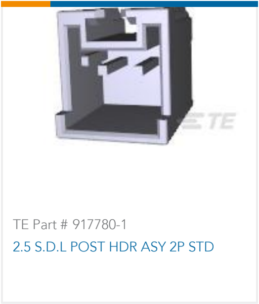
TE Part # 917780-1 2.5 S.D.L POST HDR ASSY 2P STD