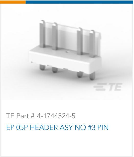
TE Part # 4-1744524-5 EP 05P HEADER ASSY NO #3 PIN