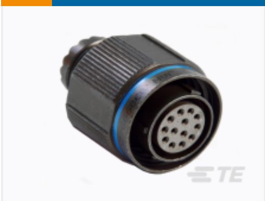
TE Part # YDTS26W11-98SNV001 PLUG ASSY