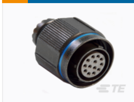
TE Part # YDTS26W25-37PNV001 PLUG ASSY