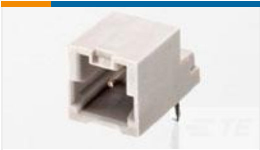
TE Part # 1-292206-4 MINI CT SGL DIP H 14P NAT