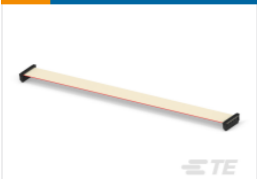
TE Part # 168341-E IDCCS SMC 1,27 40 * AU AUI 300 PVC