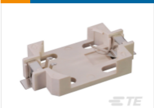
TE Part # BAT-HLD-013-SMT-TR Battery Holder 2023 SMT T&R Pack