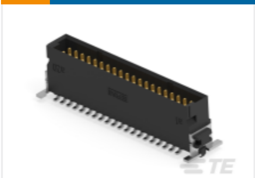
TE Part # 254539-E SMCQ 40 M AB VV 8-03 CL * H007 137 E005