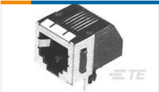
TE Part # 5555140-2 MJ,LPF,R/A,6P/4C,SHLD,PNL GRD