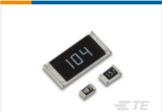
TE Part # 1-2176337-9 CRGCQ 0402 330R 1%