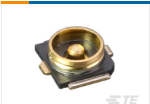
TE Part # CONMHF4-SMD-G-T MHF4 Jack 50 Ohm PCB Surface Mount