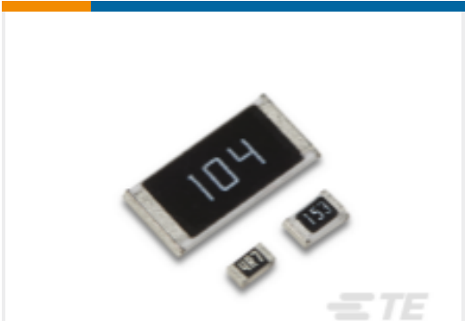
TE Part # 6-2176339-1 CRGCQ 0603 1M0 1%