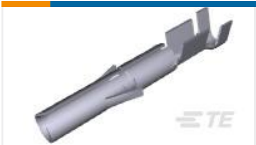
TE Part # 350570-6 UMNL SOK 24-18 AUPHBZ