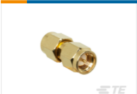
TE Part # ADP-SMAM-SMAM-G SMA Plug to SMA Plug