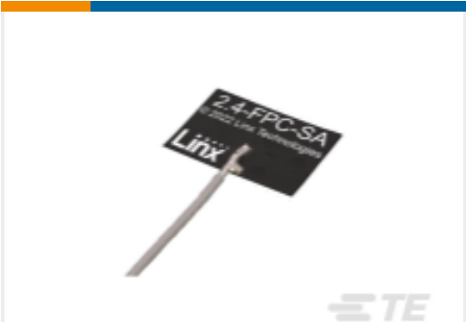
TE Part # L9000054-01 Antenna 2.4 FPC SH 12x8 100 UFL