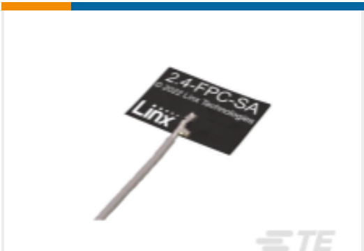
TE Part # L9000058-01 Antenna 2.4 FPC SH 12x8 50 UFL