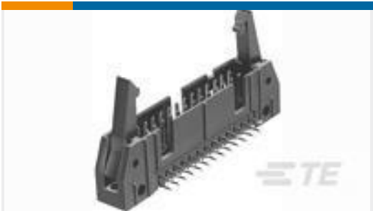
TE Part # 5499786-2 A/L UNIV HDR 14P RA LG LAT