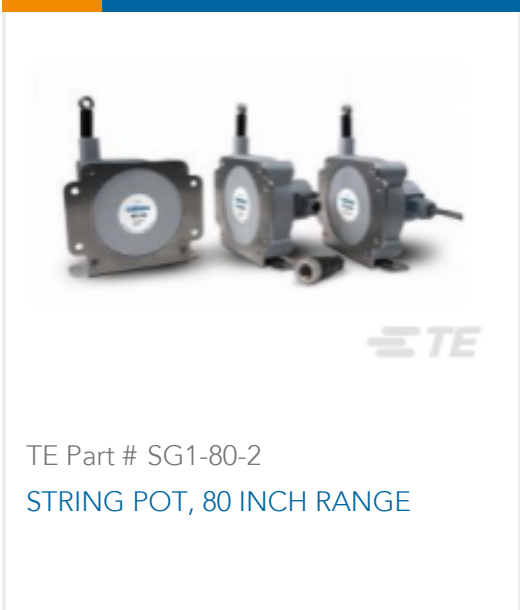
TE Part # SG1-80-2 STRING POT, 80 INCH RANGE