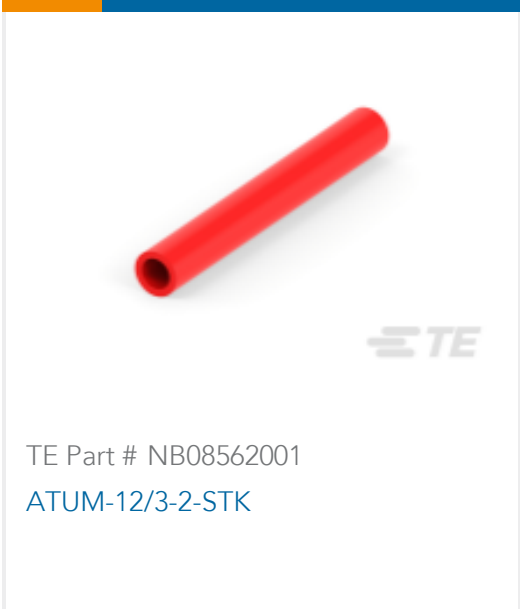
TE Part # NB08562001 ATUM-12/3-2-STK