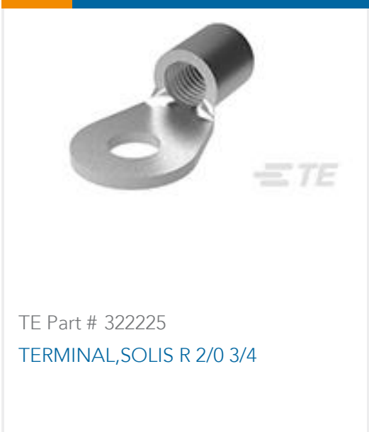
TE Part # 322225 TERMINAL,SOLIS R 2/0 3/4