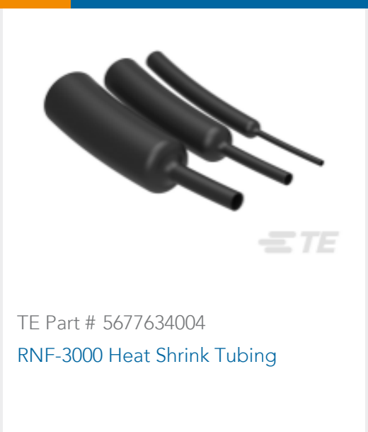
TE Part # 5677634004 RNF-3000 Heat Shrink Tubing