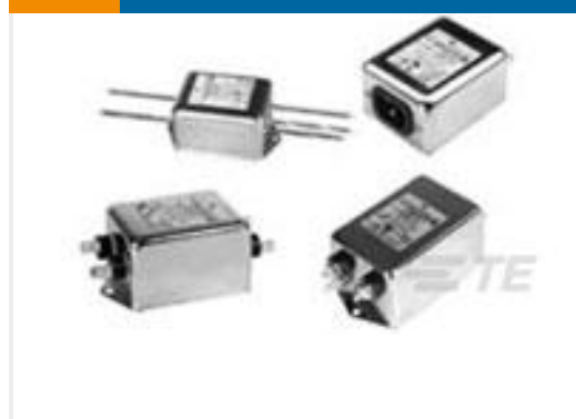
TE Part # 1-6609032-3 10VR1=F7206 S0