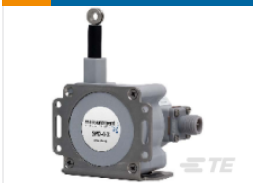
TE Part # SPD-4-3 STRING POT 4.75 INCH RANGE