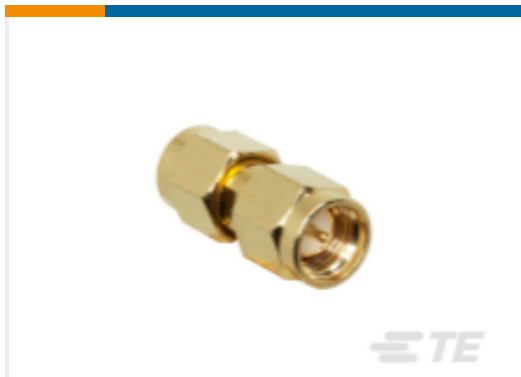
TE Part # ADP-SMAM-SMAM-G SMA Plug to SMA Plug