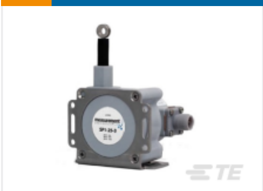
TE Part # SP1-4 STRING POT 4.75 INCH RANGE