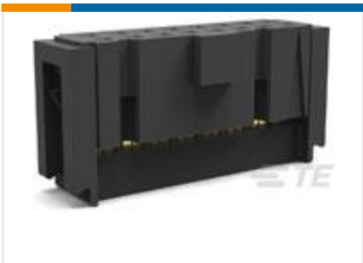
TE Part # 1658527-4 622-1041LF FEM SOCKET,LEAD FREE