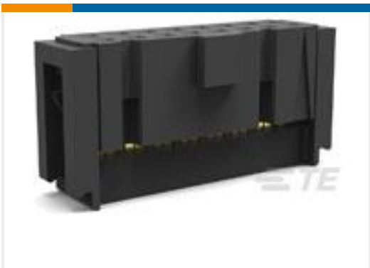
TE Part # 1658527-3 622-1030LF FEM SOCKET,LEAD FREE