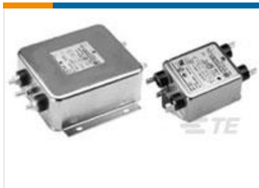
TE Part # 6609042-4 20VS1=F7249 S0