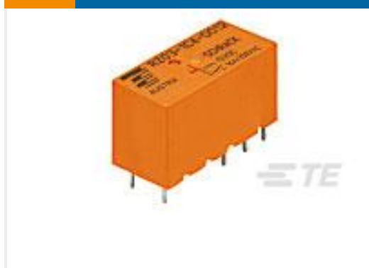
TE Part # 7-1415899-7 RZ03-1C4-D012-R