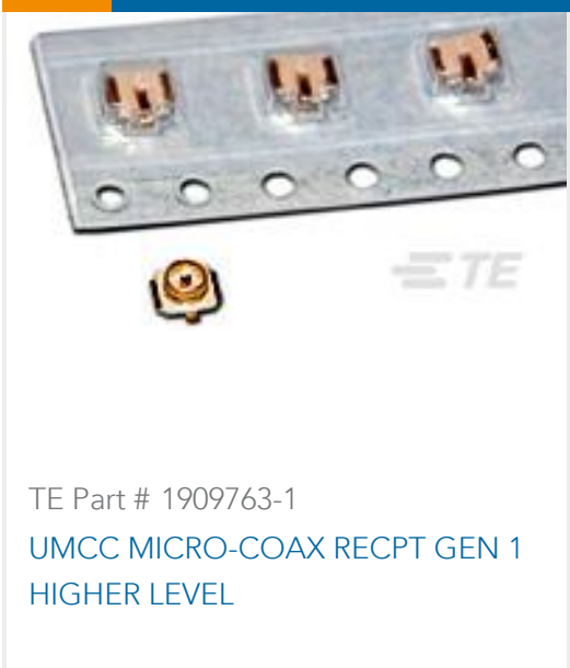
TE Part # 1909763-1 UMCC MICRO-COAX RECPT GEN 1 HIGHER LEVEL