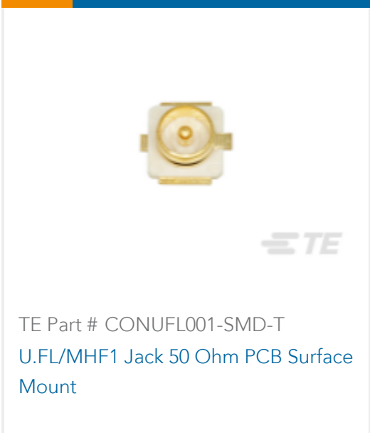
TE Part # CONUFL001-SMD-T U.FL/MHF1 Jack 50 Ohm PCB Surface Mount

Product Drawings Connector, Thru Hole-IDC, 2 pos, 20AWG