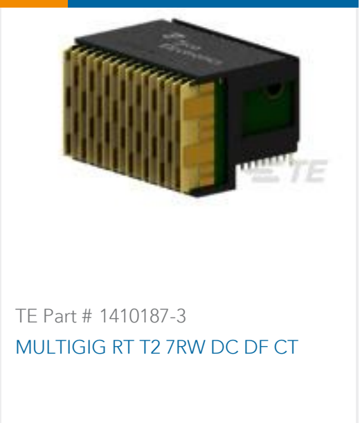
TE Part # 1410187-3 MULTIGIG RT T2 7RW DC DF CT