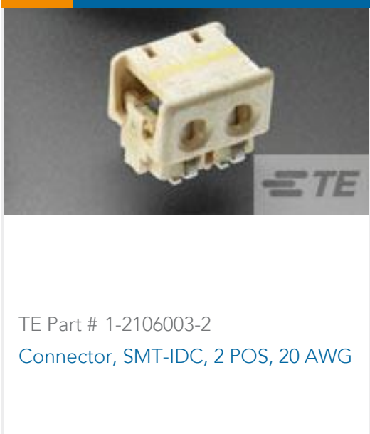
TE Part # 1-2106003-2 Connector, SMT-IDC, 2 POS, 20 AWG