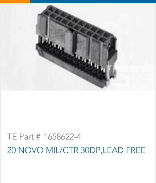
TE Part # 1658622-4 20 NOVO MIL/CTR 30DP,LEAD FREE