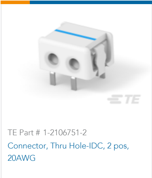
TE Part # 1-2106751-2 Connector, Thru Hole-IDC, 2 pos, 20AWG