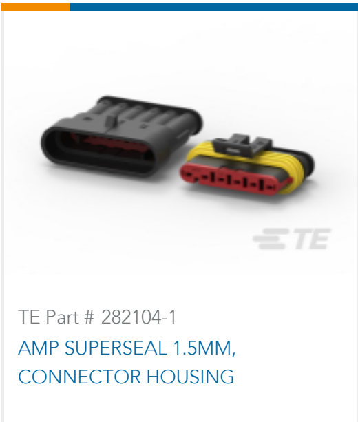
TE Part # 282104-1 AMP SUPERSEAL 1.5MM, CONNECTOR HOUSING