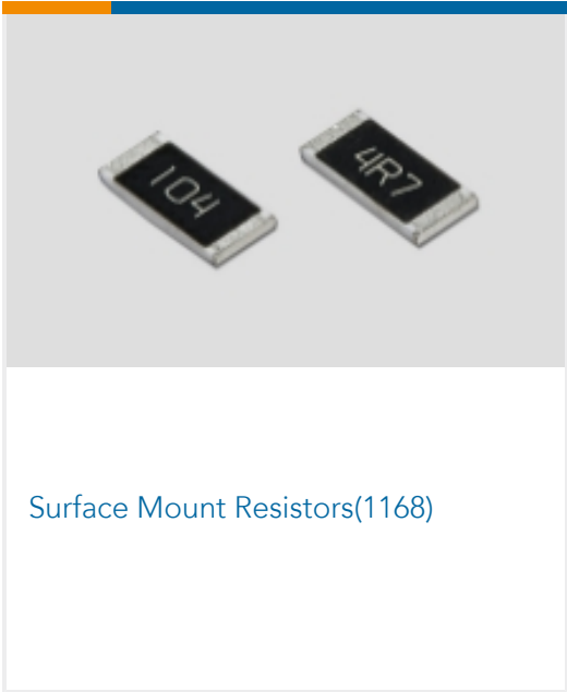
Surface Mount Resistors(1168)