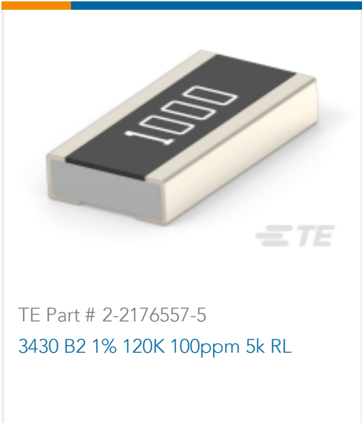
TE Part # 2-2176557-5 3430 B2 1% 120K 100ppm 5k RL