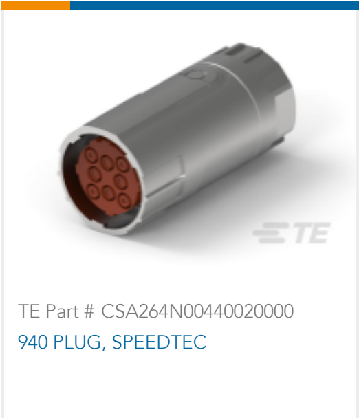
TE Part # CSA264N00440020000 940 PLUG, SPEEDTEC