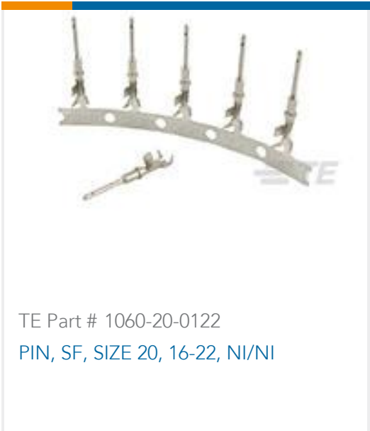
TE Part # 1060-20-0122 PIN, SF, SIZE 20, 16-22, NI/NI