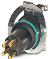
Contact carrier, 4-position, Pin, straight, M8, coding: A, PCB mounting, SMD reflow, Alternative product in accordance with RoHS II without Exemption 6c (Pb < 0.1 %) item no.: 1308283

Please be informed that the data shown in this PDF document is generated from our online catalog. Please find the complete data in the user documentation. Our general terms of use for downloads are valid.