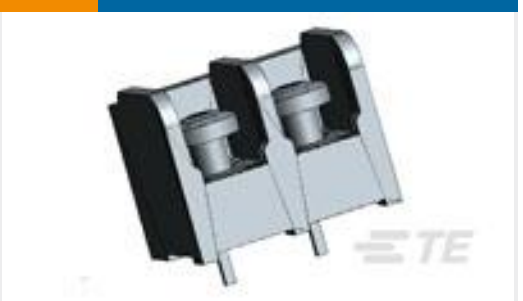
TE Part # 5-1437657-7 8PCV-02-006=#8 TRIBARRIER TERM