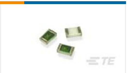
TE Part # 7-2176091-4 RP 2A 0.25W 348R 0.1% 25PPM 1K RL