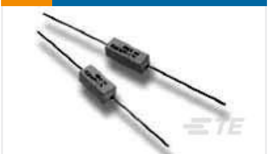
TE Part # 1623819-7 SBL4 R01 5%