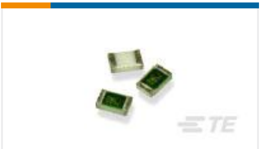
TE Part # 3-1879338-2 CPF 0603 56K2 1% 50PPM 1K RL