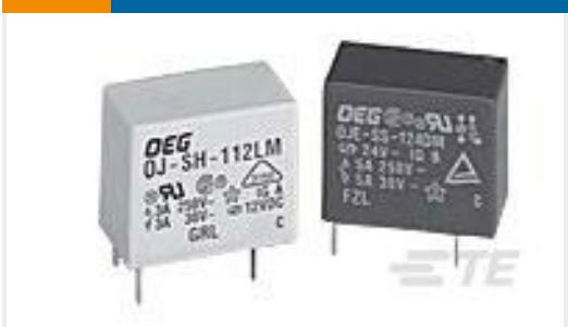
TE Part # 4-1419128-4 OJE-SS-112HMF,F000