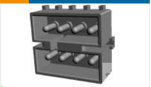
TE Part # 350212-1 08C CMNL HDR ASSY PC NATL