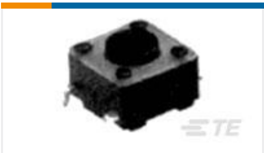
TE Part # 4-1437565-9 FSM6JSMA=SMT,TACTILE,PB SWITCH