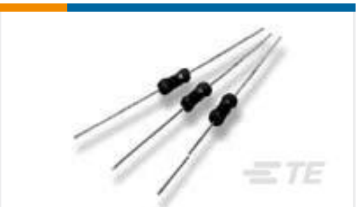
TE Part # 1625893-5 5W SM M/OX 5% 47K