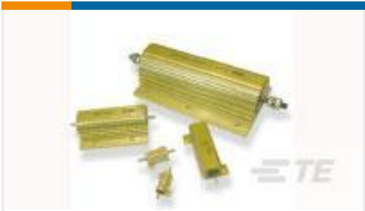
TE Part # 3-1630027-4 HSC300 R10 5%