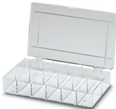
Assortment box, dimensions: 210 x 105 x 36 mm, 12 compartments, compartment size: 57 x 32 mm

Please be informed that the data shown in this PDF document is generated from our online catalog. Please find the complete data in the user documentation. Our general terms of use for downloads are valid.