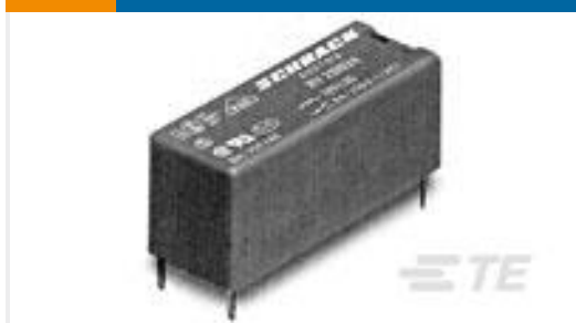
TE Part # 4-1393224-9 RY211024