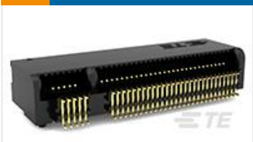
TE Part # 2199230-4 M.2 0.5PITCH 4.2H KEY E 15U" AU