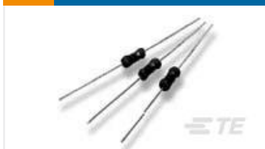
TE Part # 1-1625892-3 3W SM M/OX 5% 12R