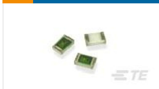
TE Part # 2176093-1 RP 2A 0.25W 9K09 0.1% 25PPM 1K RL