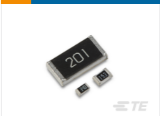
TE Part # 1-2176325-9 CRGP 0402 330R 1%