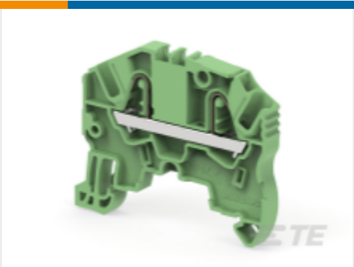
TE Part # 1SNK705061R0000 ZK2.5-GN