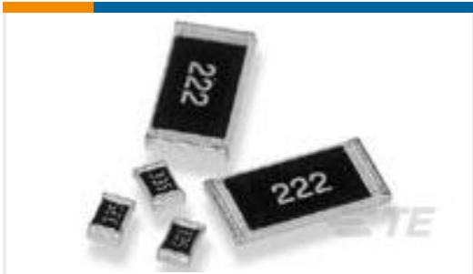
TE Part # 1623096-1 CRG0805 1% 100R