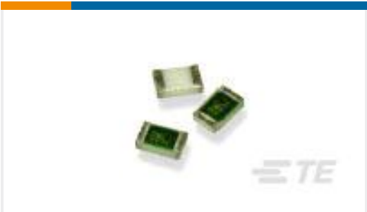
TE Part # 1-1879214-5 CPF 0402 453R 0.1% 25PPM 1K RL