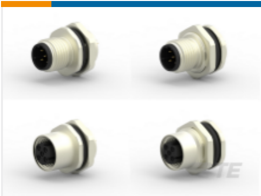
TE Part # T4131012081-000 M12 Panel Mount Solder Cups