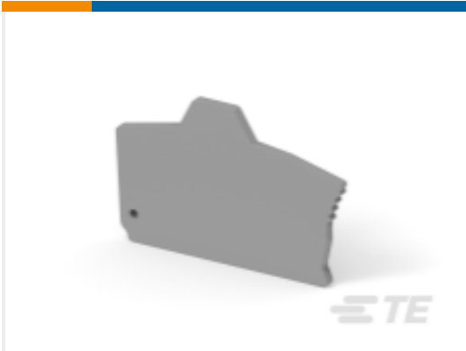
TE Part # 1SNK705910R0000 EK2.5