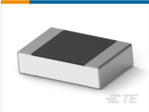
TE Part # 9-2176376-6 RQ 0805 121K 0.1% 10PPM 1K RL