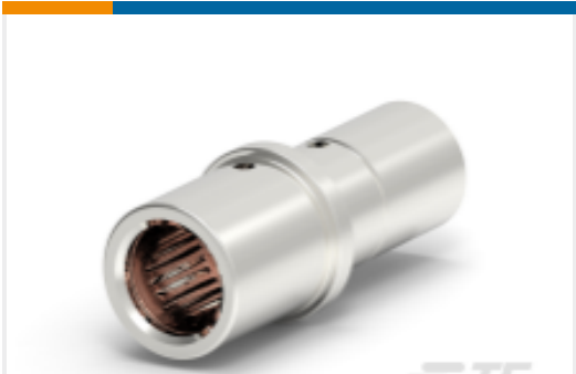
TE Part # SRK-SC-080-25-601 SOC, SOLID, SIZE M8, 25mm2, AG