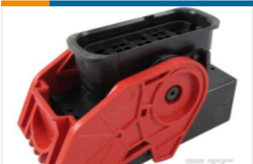
TE Part # SRK06-MDA-32A-001 PLG, 32P, BLK, E, A