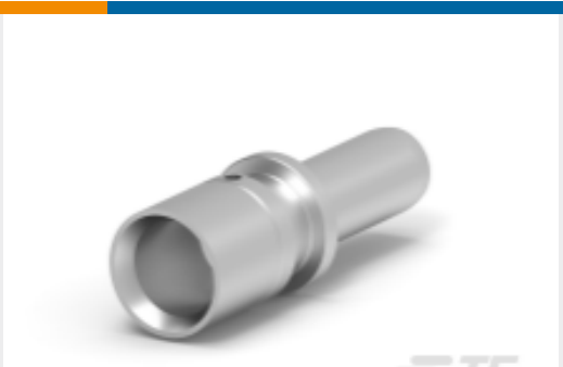
TE Part # SRK-PC-080-35-601 PIN, SOLID, SIZE M8, 35mm2, AG