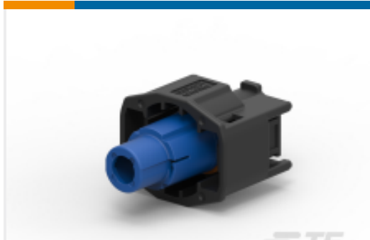
TE Part # DTSK06-1-08SB PLUG, INLINE, KEY B