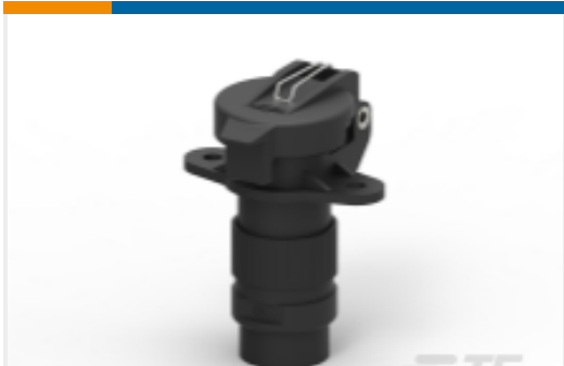
TE Part # CAR2SC68 CAR RECPT DIN9680 2way, IP68