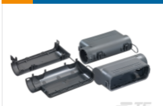
TE Part # 2500033-1 SRC Power Blind Cavity Plug