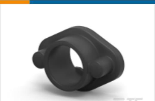
TE Part # 2289235-1 DTSKF-1, DTSK FLANGE MOUNT