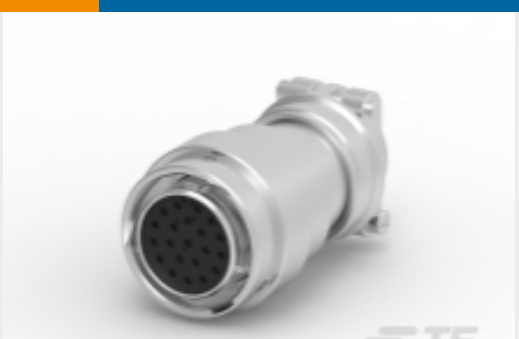
TE Part # HD36-18-21SN-059 PLG,21P,AL,N, CBL CLMP BT, DRAIN, 20,S,MC