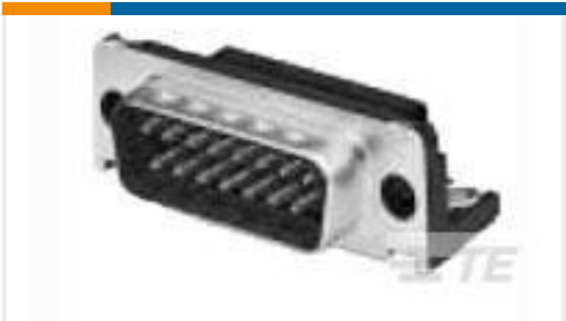
TE Part # 5747842-2 25 MSFL PLUG RA 318 (FM,BL)