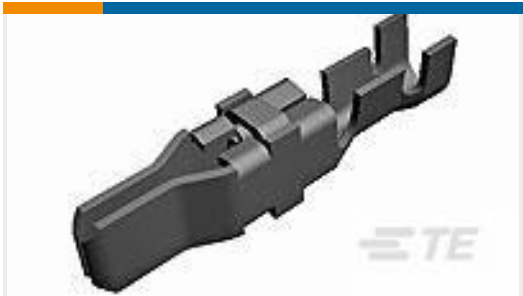
TE Part # 66261-5 MALE CONTACT ASSY. (L.P.)