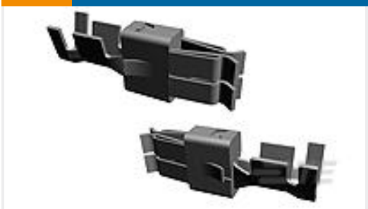
TE Part # 963709-1 SPT REC 6.3 Contact SRC Sn