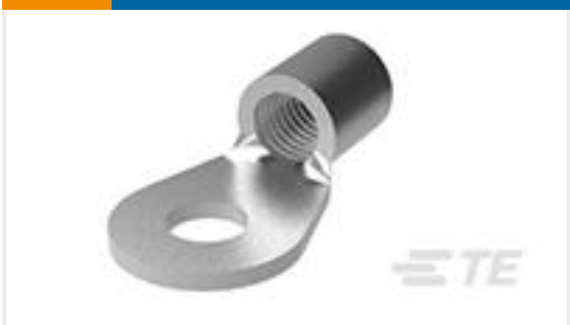
TE Part # 31807 TERMINAL,SOLIS R 8 10