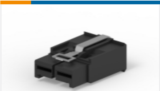
TE Part # 1982299-1 ELCON MINI 2P CABLE CONN,WITH CODING(R)