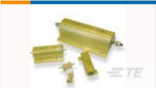
TE Part # 2-1630024-1 HSC250 R47 5%