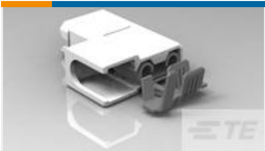
TE Part # 520971-4 ULTRA-POD 250 ASY REC 18-14 AWG TPBR