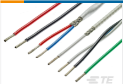
TE Part # 749087-000 44A9605-16-7