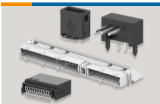
PCB Headers & Receptacles (37)