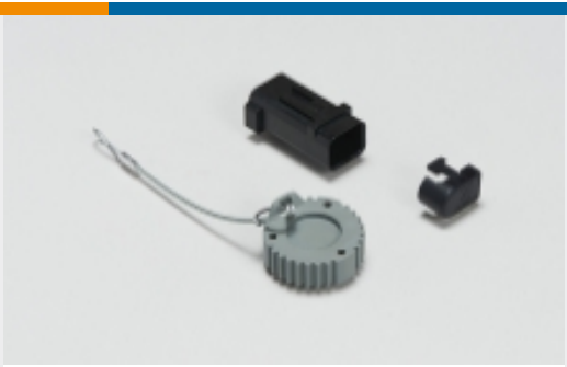
Automotive Connector Caps & Covers (19)