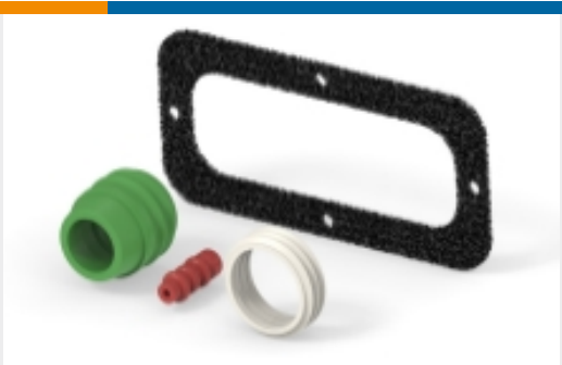
Connector Seals & Cavity Plugs (6)