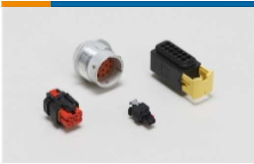
Automotive Housings (654)