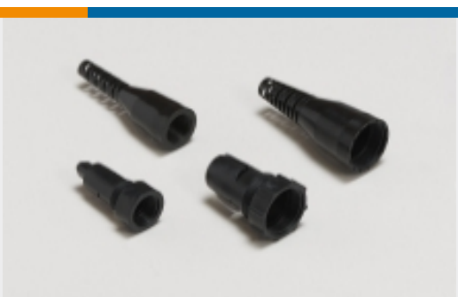
Connector Strain Relief (28)