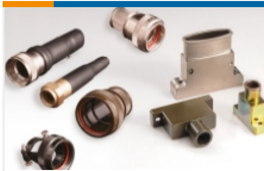
Connector Backshells (61)