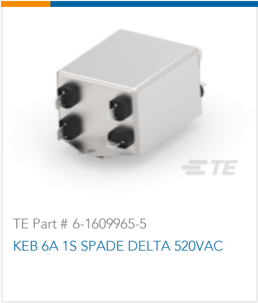
TE Part # 6-1609965-5 KEB 6A 1S SPADE DELTA 520VAC