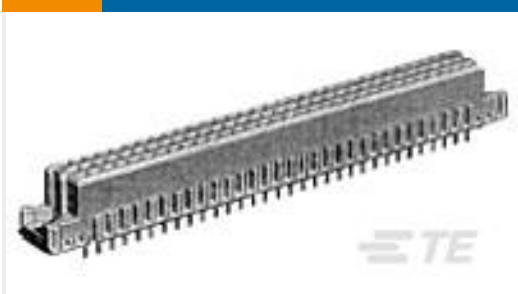
TE Part # 535090-4 096 EURO TYPE C RECEPT ST ASSY