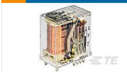
TE Part # 1-1393767-5 R10-E2X2-V700=R10