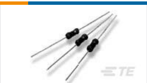
TE Part # 7-1625890-0 2W SM M/OX 5% 82K