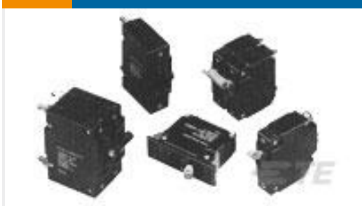
TE Part # 6-1393252-1 W67-X2Q12-30=M6/M7/M9/W6/W7