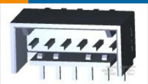
TE Part # 2-644488-6 06P MTA100 SHRD HDR F/L R/A SN