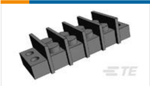
TE Part # 1546306-4 4P .374" DR BARRIER STRIP