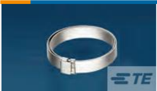
TE Part # CW2824-000 R85049/128-7