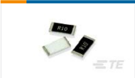
TE Part # 1879463-8 RL73H 2E R20 1% 5K RL