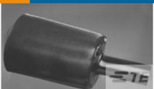
TE Part # CX7202-000 RHW-24/6-1200/ADH-0