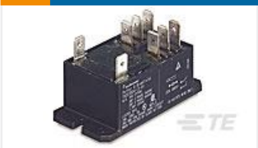
TE Part # 4-1393211-4 T92P11A22-240