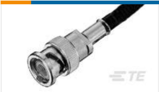
TE Part # 2-5330061-1 BNC PLUG