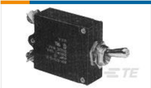
TE Part # 3-1393247-8 W31-X2M1G-30=W23/W31