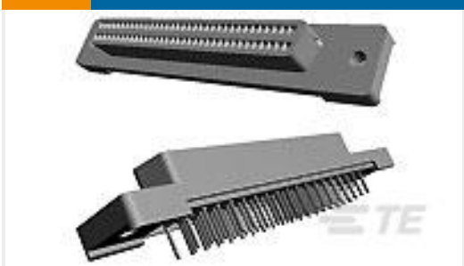
TE Part # 5749070-9 100 50SR VERT RCPT ASSY