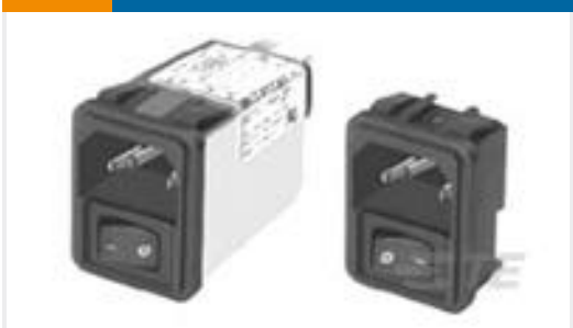
TE Part # 1-6609113-4 10CFS1 S0=F7826