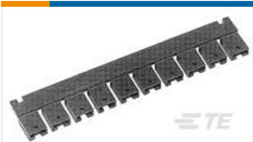
TE Part # 382811-9 SHUNT, ECON, PHBR 15AU, RED