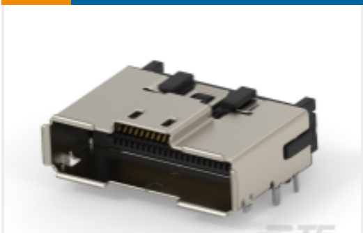
TE Part # 2292055-1 RECEPTACLE ASSY RA 50 POSN MBC