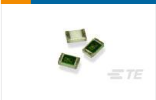
TE Part # 1-1614884-1 CPF 0805 5R6 0.1% 25PPM 1K RL