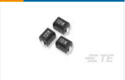
TE Part # 1624094-2 3613C 100UH 10%