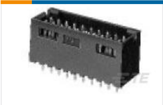
TE Part # 6-103168-5 34 MODII HDR DRST SHRD .100CL