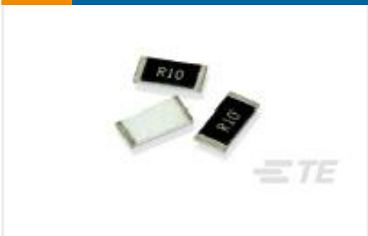
TE Part # 2-1879458-4 RL73N 1H R91 1% 5K RL