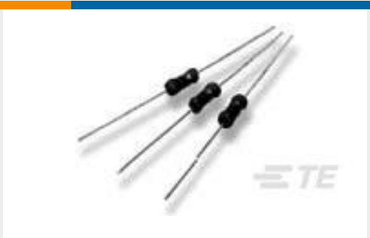
TE Part # 7-1879352-7 RR02 5% 470R AMMO