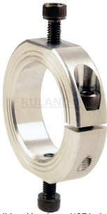
*Additional hardware NOT included