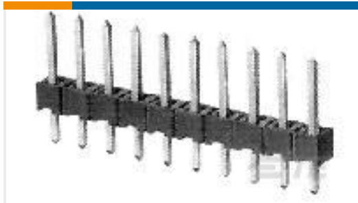
TE Part # 826629-5 AMPMODU II HEADER