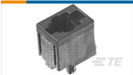
TE Part # 5520258-3 M/JTOP6P/6CPNL STOPSTRAY P