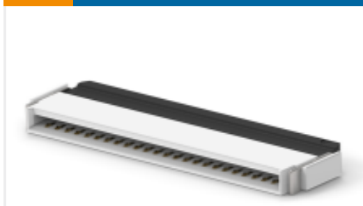
TE Part # 2-2328702-4 24 PIN 0.5mm P FPC CONN, BACK FLIP LOCK