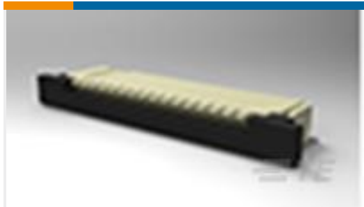
TE Part # 1-84953-6 1MM FPC HORZ.TOP CONT.ASSY 16P