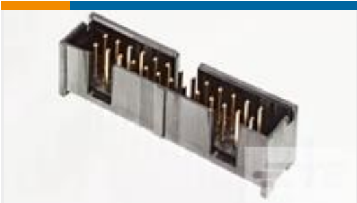
TE Part # 5103308-2 A/L LOW PRO HDR 14P VERT BLACK