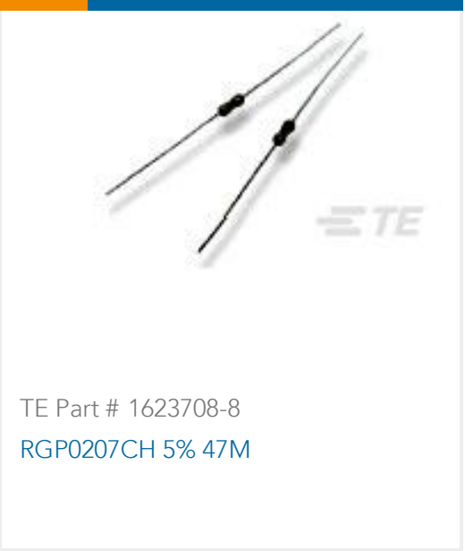
TE Part # 1623708-8 RGP0207CH 5% 47M