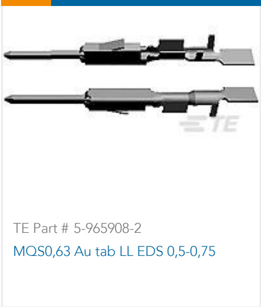
TE Part # 5-965908-2 MQS0,63 Au tab LL EDS 0,5-0,75