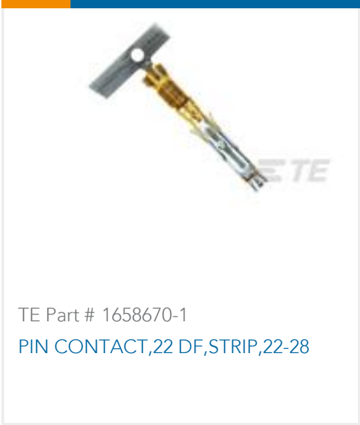
TE Part # 1658670-1 PIN CONTACT,22 DF,STRIP,22-28