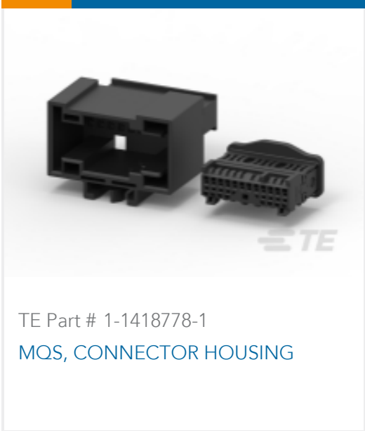
TE Part # 1-1418778-1 MQS, CONNECTOR HOUSING