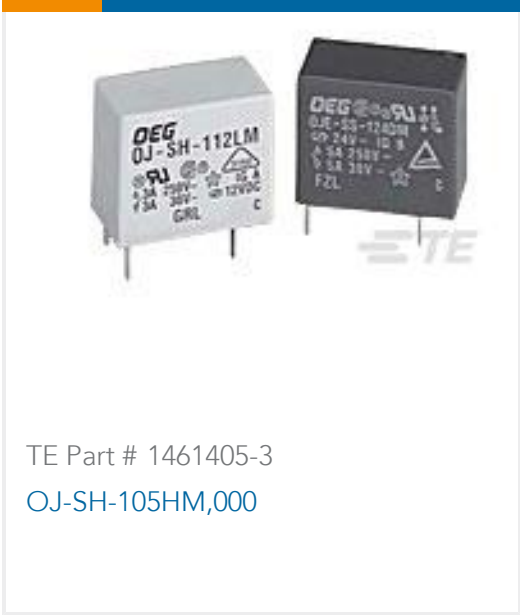
TE Part # 1461405-3 OJ-SH-105HM,000