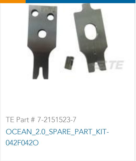
TE Part # 7-2151523-7 OCEAN_2.0_SPARE_PART_KIT-042F042O

Product Drawings 40P.A/L.STRAIN REL. English 40P.A/L.STRAIN REL. English