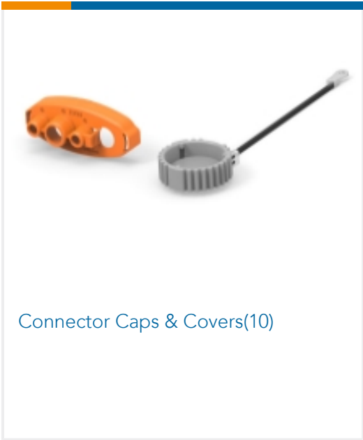
Connector Caps & Covers(10)