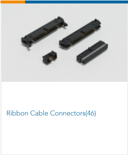
Ribbon Cable Connectors(46)