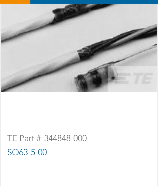
TE Part # 344848-000 SO63-5-00