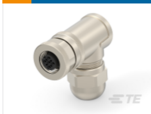
TE Part # T4112012051-000 M12 F, 5P GOLD A_CODE RA SHIELDED PG9