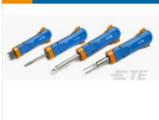
TE Part # 1-1579007-3 EXTRACTION TOOL