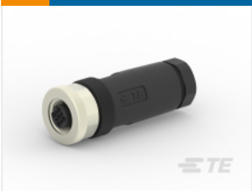
TE Part # T4110402051-000 M12,FEMALE,STRAIGHT,B CODE,5P, PG9,GOLD