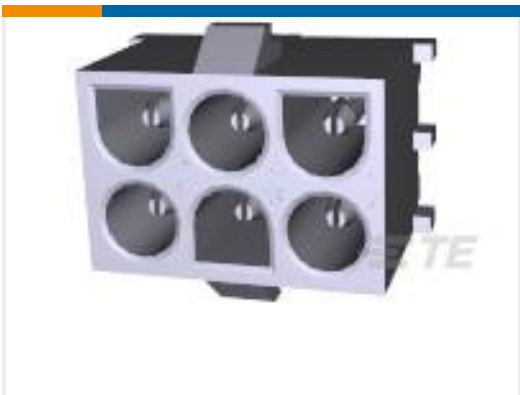
TE Part # 350732-1 06P UMN L PIN HDR ASSY 94VO