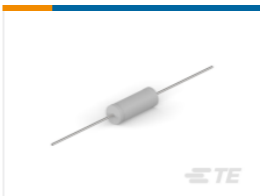
TE Part # 9-2176412-2 5W XSM M/OX 5% 33K