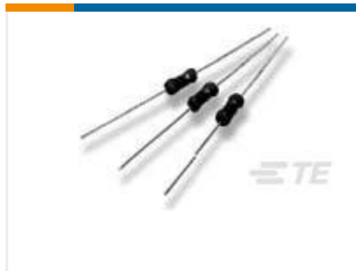
TE Part # 5-1625892-3 3W SM M/OX 5% 47K