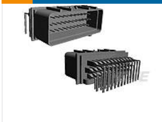
TE Part # 344108-1 36 WAY HEADER WIRE TO BD.FOR E