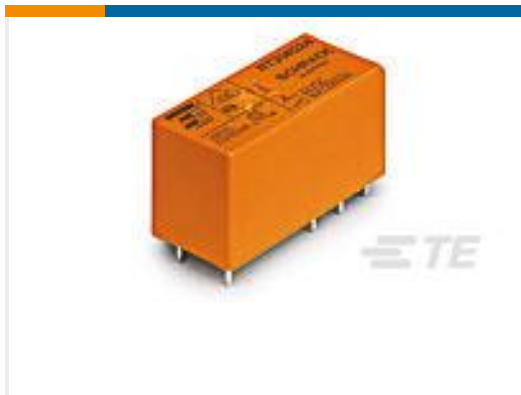
TE Part # 1419108-1 RT114012