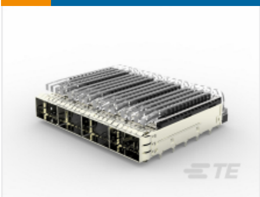
TE Part # 2170790-3 CAGE ASSY, 1X4, QSFP28, SPRING, HS, LP