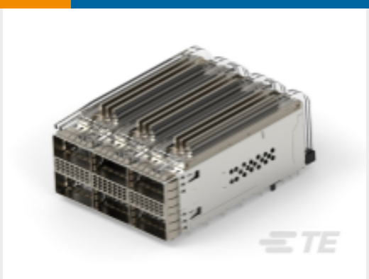
TE Part # 2299924-1 ZQSFP+ STACKED REC ASSEMBLY 2X3,4LP HS