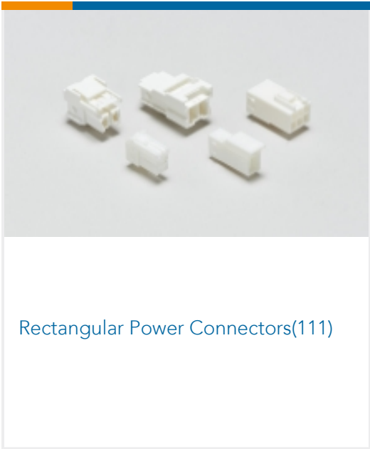
Rectangular Power Connectors(111)