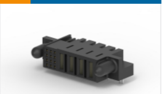
TE Part # 1-6450162-2 MBXL R/A RCPT 4P+12S