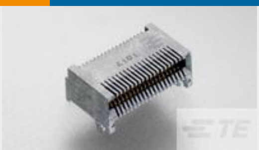
TE Part # 2110819-1 QSFP+ Enh EVERCLEAR PT Conn