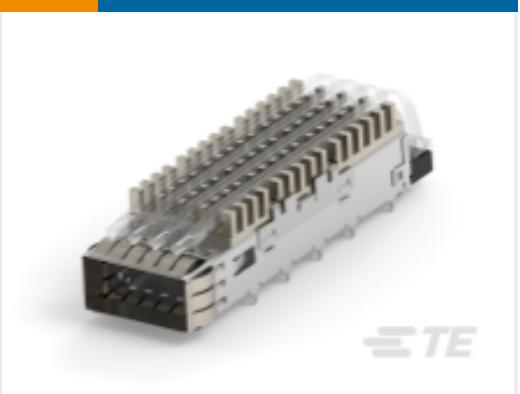
TE Part # 5-2170705-8 CAGE ASSY, QSFP28 1X1, SPRING, HS, C LP