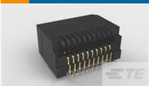
TE Part # 1367073-1 20 POS SMT CONN, SFP, 15AU