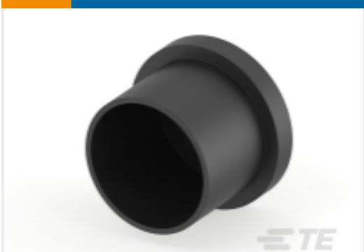
TE Part # 1-2407269-2 CAP, CPC, SIZE 11 RECP & 13 PLUG, BLACK