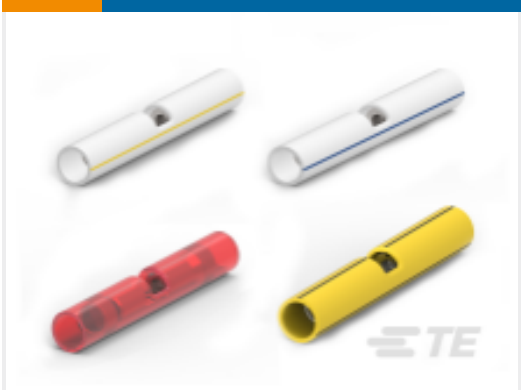
TE Part # 8-323994-3 PIDG Butt Splices