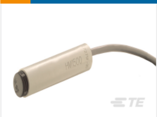
TE Part # HPP805A031 HM1500LF HUMIDITY MODULE