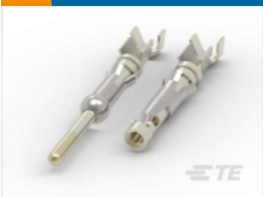
TE Part # 66358-9 Strip Pin and Socket Contacts, Type III