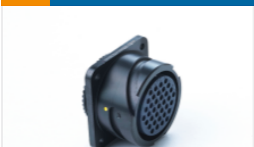
TE Part # Y5015-000000100140 FIXED SOCKET CONNECTOR