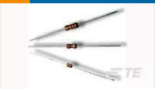
TE Part # 4-1623930-0 CFR25 5% 1M8