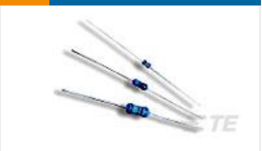
TE Part # 1622719-1 LR2 1% 24R