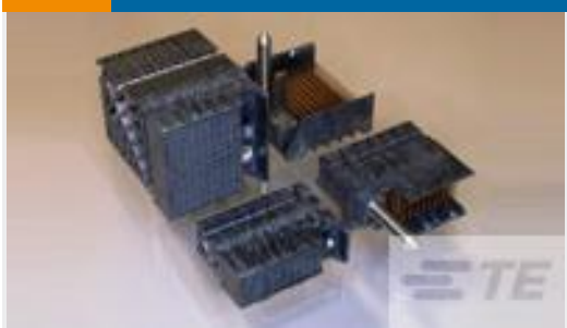
TE Part # 2007779-1 IMP100S,H,V3P10C,LG,REW39,4.5