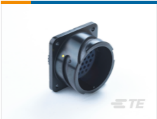
TE Part # Y5015-000000100139 FIXED PIN CONNECTOR