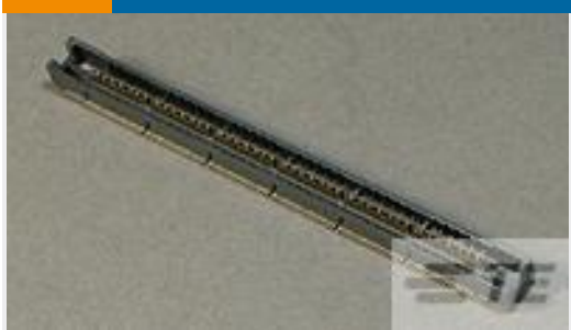
TE Part # 767114-6 MICT,REC,228,ASY,.025,TAPE,CAP