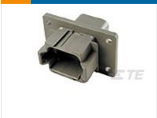
TE Part # DT04-08PA-L012 REC, 8P, GRY, N, FLANGE, A