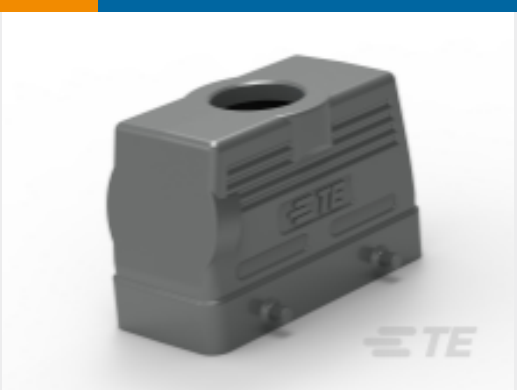
TE Part # T1220160121-000 H16B-TG-PG21