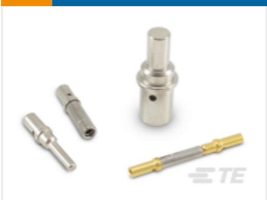
TE Part # 0462-201-20141 DEUTSCH Solid Contacts