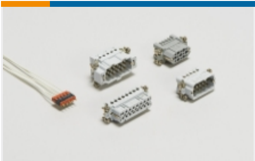
Rectangular Contact Inserts(15)