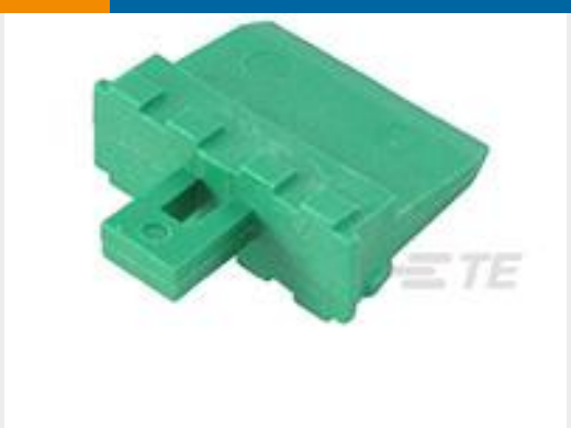
TE Part # W8P WEDGE LOCK, 8P, REC, GRN, DT