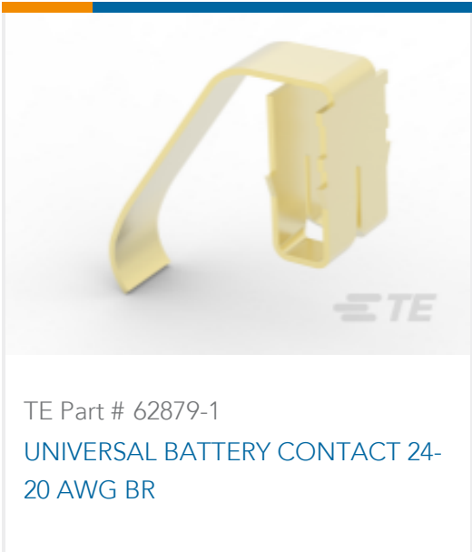
TE Part # 62879-1 UNIVERSAL BATTERY CONTACT 24-20 AWG BR