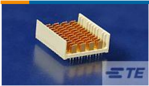
TE Part # 6469287-1 HM-ZD 4PR HDR 96P, 5.3