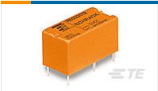
TE Part # 1956226-1 RE035012