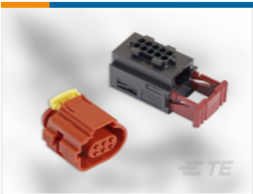
TE Part # 929504-6 Timer Connector Housing