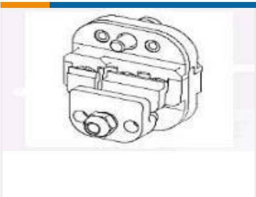
TE Part # 2063438-2 SDE UMNL 1.5-2.5mm2 DIE SET