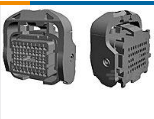
TE Part # 1717138-4 025/040 SEALED 44POS PLUG ASSY