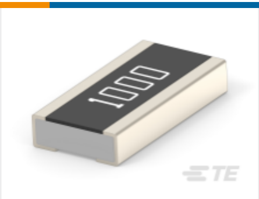
TE Part # 5-2176558-0 3430 B2 1% 100R 100ppm 1k RL