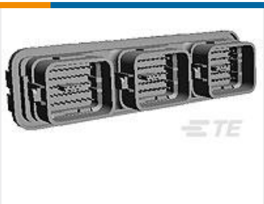
TE Part # 1717139-1 025/040 SEALED 132POS CAP ASSY