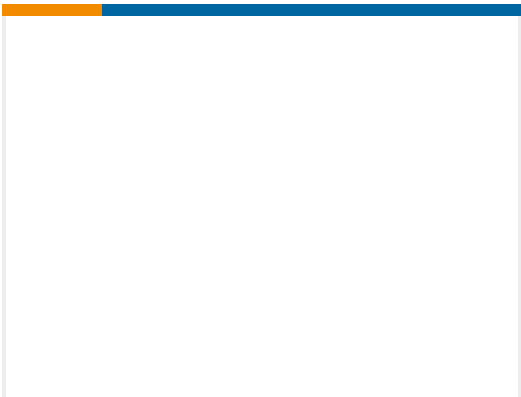
TE Part # ER6728-000 D-436-43CS9376