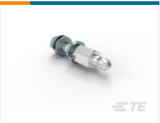
TE Part # 1-2308290-1 QL-SET FOR VARIAN C VW REAR WALL MOUNTG