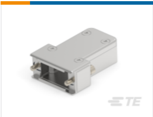
TE Part # 1-2308340-1 FULL METAL HOODS SIZE 1