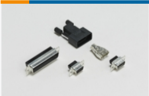
Crimp D-Sub Connectors(10)