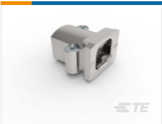
TE Part # 1-2308272-1 Cable Clamp for Size 1-3 STD/1-4 QL Shell