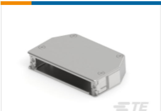
TE Part # 1-2308330-1 FULL METAL HOODS SIZE 4 (1)