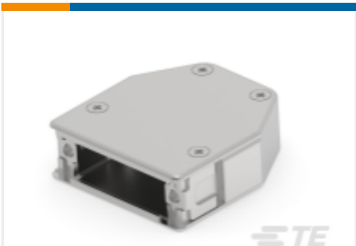
TE Part # 1-2308321-1 FULL METAL HOODS SIZE 2, (1)