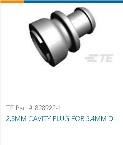
TE Part # 828922-1 2,5MM CAVITY PLUG FOR 5,4MM DI