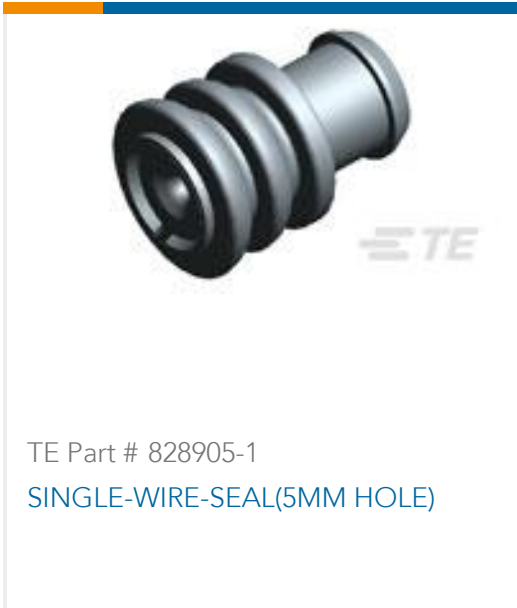
TE Part # 828905-1 SINGLE-WIRE-SEAL(5MM HOLE)