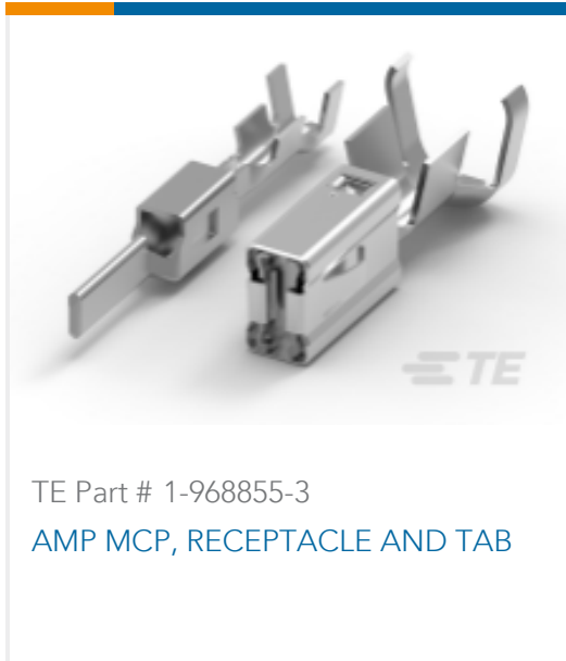
TE Part # 1-968855-3 AMP MCP, RECEPTACLE AND TAB