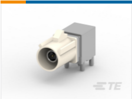
TE Part # 2291392-2 MALE ASM, 1 POS, R/A, PCB, FAKRA