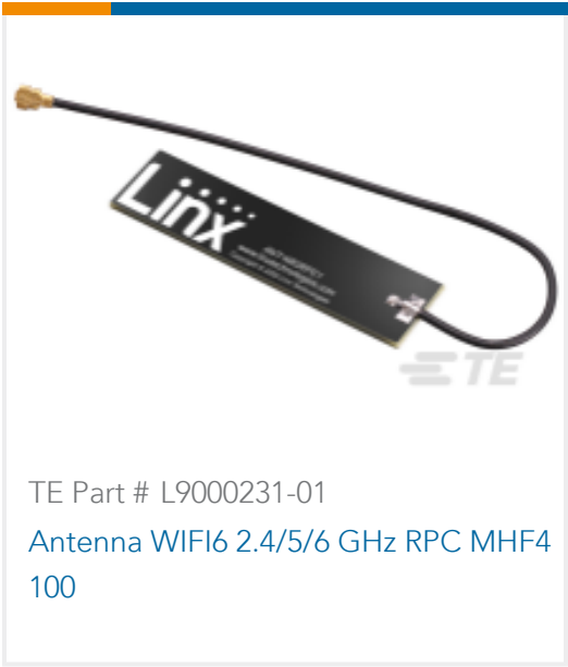
TE Part # L9000231-01 Antenna WiFi6 2.4/5/6 GHz RPC MHF4 100