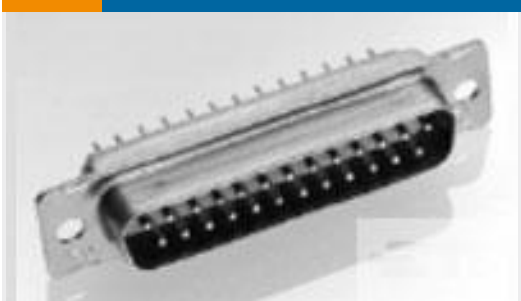
TE Part # 204509-1 AMPLIMITE,ASY,PLUG,STD,90,5