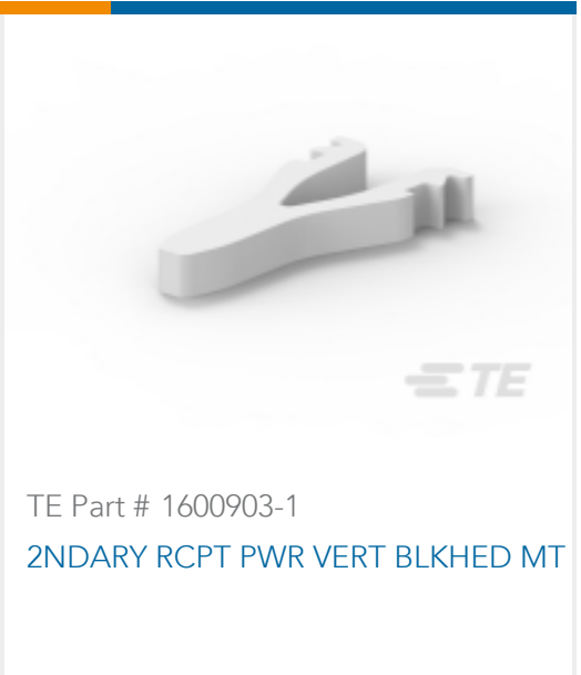
TE Part # 1600903-1 2NDARY RCPT PWR VERT BLKHED MT