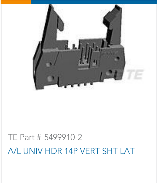
TE Part # 5499910-2 A/L UNIV HDR 14P VERT SHT LAT