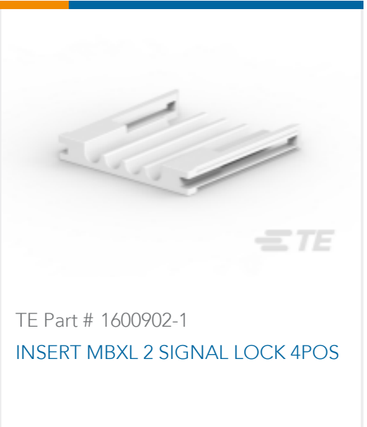
TE Part # 1600902-1 INSERT MBXL 2 SIGNAL LOCK 4POS