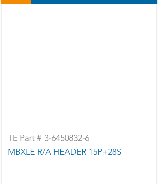
TE Part # 3-6450832-6 MBXLE R/A HEADER 15P+28S