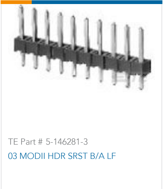
TE Part # 5-146281-3 03 MODII HDR SRST B/A LF